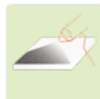
Overlac- quering/ Varnishing