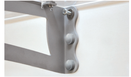
Complete wall mounting kit included

135 W x 89 D x 15.5 H cm 53.1" W x 35" D x 6.1" H