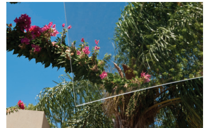
Excellent light transmission